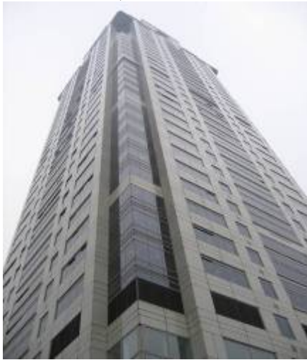
Lippo Plaza Building