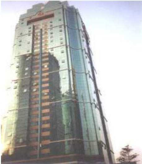
Huadu Mansion Building