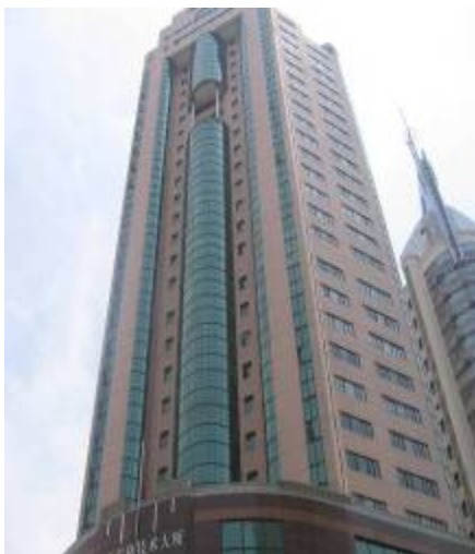
COSCO Financial Building