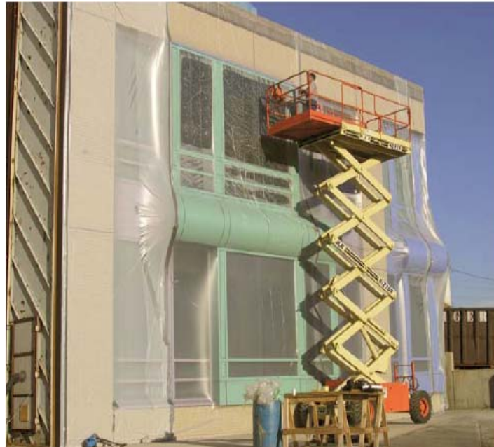
Figure U-1. Lab mockup during ASTM E283 air infiltration test

Resources for Testing: This sub-annex contains 3 parts including