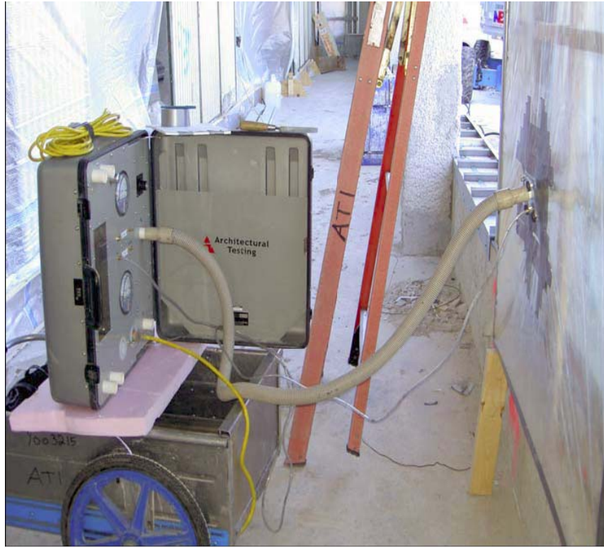
Figure 11 ASTM E 783 test with exterior chamber, testing a window and its perimeter window-to-wall joint