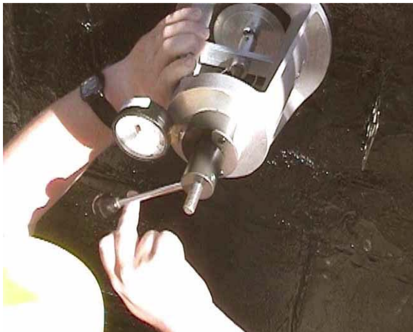
Figure 10 ASTM D 4541 adhesion pull testing